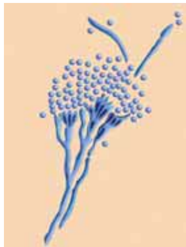
Penicillin Mold Fungus

A fungus is actually a primitive plant. Fungi can be found in air, in soil, on plants, and in water. Thousands, perhaps millions, of different types of fungi exist on Earth. The most familiar ones to us are mushrooms, yeast, mold, and mildew. Some live in the human body, usually without causing illness. Fungal diseases are called mycoses.