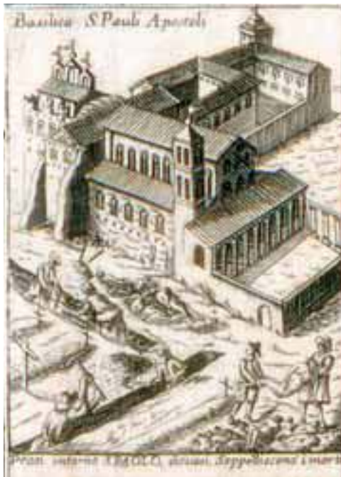
Black Death Plagued Medieval Europe

Smallpox, which is caused by a variola virus, was described in ancient Egyptian and Chinese writings. According to some researchers, over the centuries smallpox was responsible for more